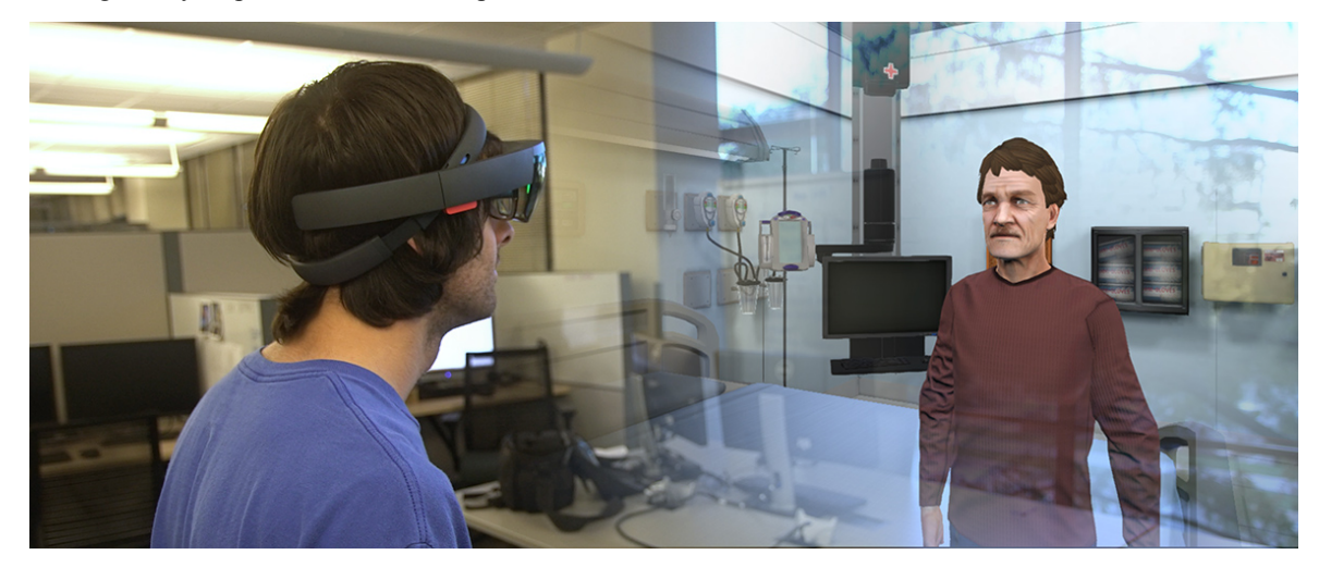
Figure 3. Augmented Reality technology can overlay synthetic objects onto a real-world environment. This mockup represents the possibility for projecting a virtual patient in a hospital room using a device such as the Microsoft HoloLens.

AR can also be safer for the wearer in any existing environment as they can maintain their ability to visually navigate their natural surroundings. Additionally, though head mounted AR device options are currently limited, some of the emerging technologies are "untethered" and do not require physical wired connections to external equipment. The elimination of external wiring further diminishes potential safety issues and could allow a student to focus more intently