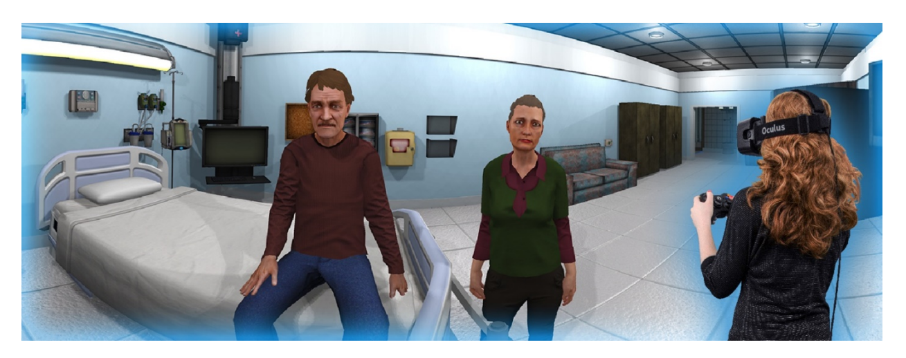
Figure 1. Virtual Reality technology immerses learners completely in a synthetic environment. This mockup represents an interaction with two virtual characters, Walter and Susan, using Oculus - a VR head-mounted display device.

to the virtual patient; the ability to grade both the effectiveness of interview skills and the pleasantness/professionalism of the user. The anticipated outcomes are that medical students will improve and enhance their verbal and nonverbal communication skills. Success could be measured in the way EVPs will accurately represent emotions and unique patient cultures and integrate with the overall curriculum and specific communications. Finally, EVP sessions will be self-driven practice, an "anytime, anywhere" competency-based model that is flexible and has immediate feedback for adaptive learning by students. As defined and discussed further in the next section, we aim to create a natural user interface for this specific use case.